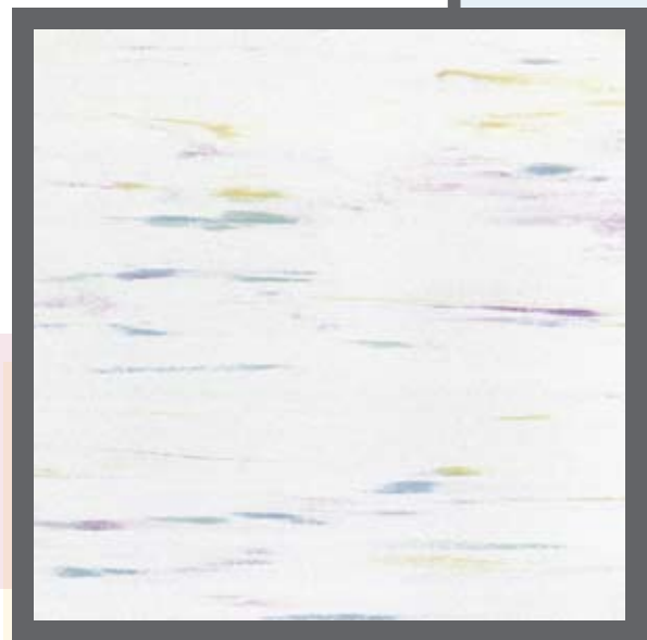
Jelly Bean 012-07

Tiles are made from natural materials, therefore may vary in color.