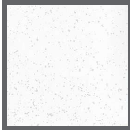
Ice Winter 010

Tiles are made from natural materials, therefore may vary in color.